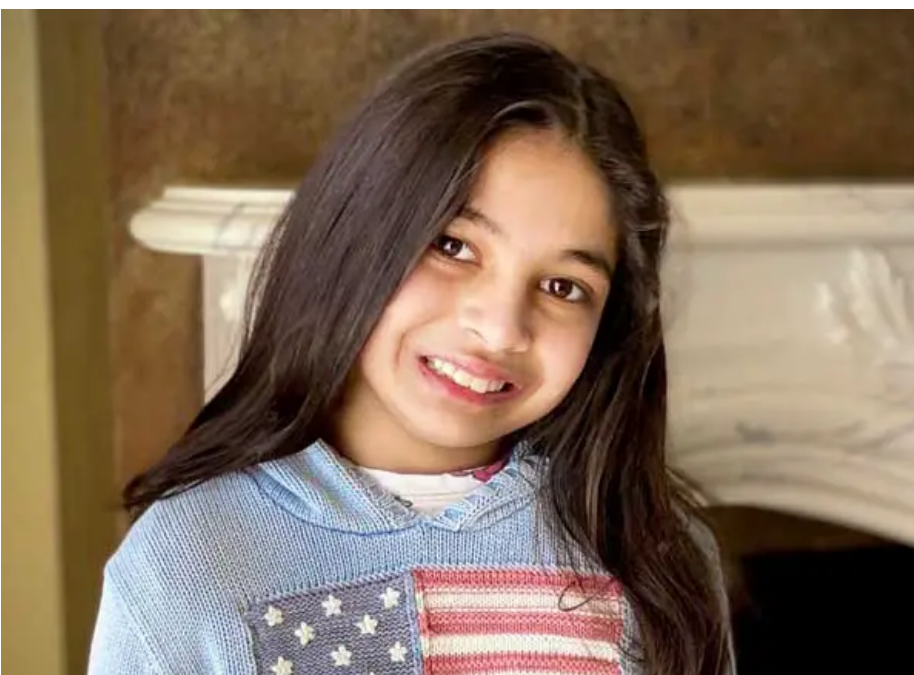
[Guinness Book of Records, 2023]